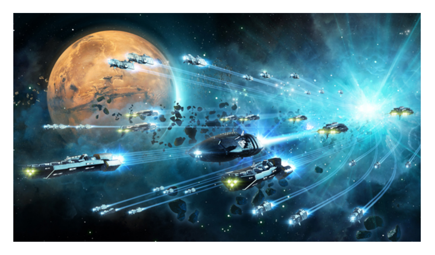
A multitude of Imperial warship fleets and mammoth motherships have crushed every trace of opposition. The situation was looking bleak, when they suddenly halted their armada and re-shifted their focus on fortifying Starpoint with staggering numbers. Rumours soon spread that they were afraid of something coming after them through the T-gate, from what was supposed to be the core of the Empire. What are they running from that makes even the mighty Empire tremble?